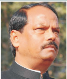
Sri Raghubar Das Hon'ble Chief Minister Govt. of Jharkhand