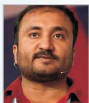
Sri Anand Kumar Mathematician & Founder Super 30