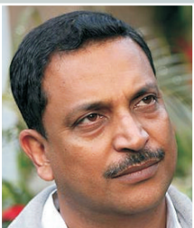
Sri Rajiv Pratap Rudy Hon'ble Minister of State for Ministry of Skill Development & Parliamentary Affairs Govt. of India