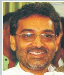
Sri Upendra Kushwaha Hon'ble Minister of State for Ministry of HRD Govt. of India