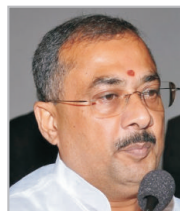
Sri Sushil Kr. Singh Hon'ble MP Aurangabad, Bihar