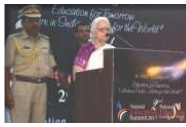
Smt. Mridula Sinha Hon'ble Governor of Goa