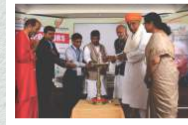
Inaugural of Education Summit and Awards 2017, Goa