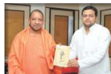
Shri Adityanath Yogi Hon'ble Chief Minister Of Uttar-Pradesh