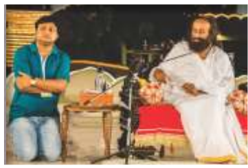
HH Gurudev Sri Sri Ravi Shankar Founder, Art of Living