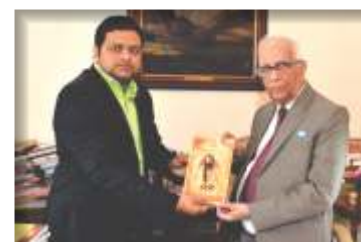
Shri Keshrinath Tripathi Hon'ble Governor Of West-Bengal