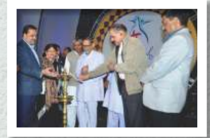
Inaugural of Youth Icon Award Ceremony 2012- Dhanbad (Jharkhand)