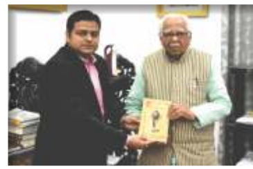
Shri Ram Naik Hon'ble Governor Of Uttar - Pradesh