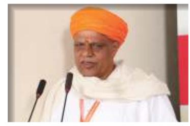
Sri Virendra Singh Mast Hon'ble MP-Bhadohi (Uttar Pradesh)