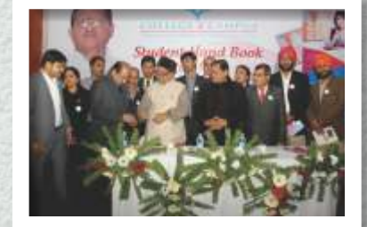
Launching of Student Hand Book - 2014