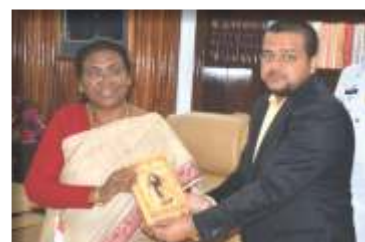
Smt. Dropadi Murmu Hon'ble Governor Of Jharkhand