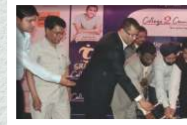
Inaugural of B-School Fair 2011 Dhanbad ( Jharkhand)