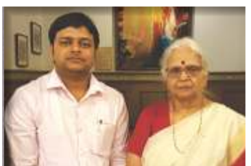
Smt. Mridula Sinha Hon'ble Governor Of Goa