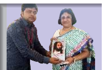
Smt. Arundhati Bhattacharya Chairman State Bank Of India