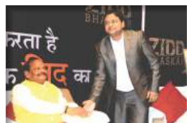
Shri Raghubar Das Hon'ble Chief Minister Of Jharkhand