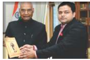
Shri Ramnath Kovind Hon'ble President Of India