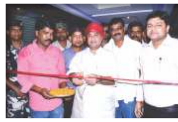
Sri Sushil Kumar Singh Hon'ble MP- Aurangabad, Bihar