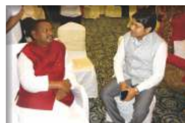
Shree Arjun Munda Chief Minister, Jharkhand-2012