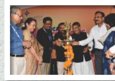
Inaugural of Jharkhand Education Summit 2015 - Ranchi (Jharkhand)