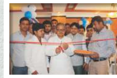
Sri P. K. Shahi Hon'ble Education Minister, Bihar